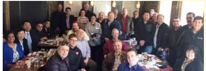
Great group gathered in Paramus on March 2nd!

Wed. June 8, 2016 The Whitman Diner 4990 Route 42 Turnersville, NJ 08012