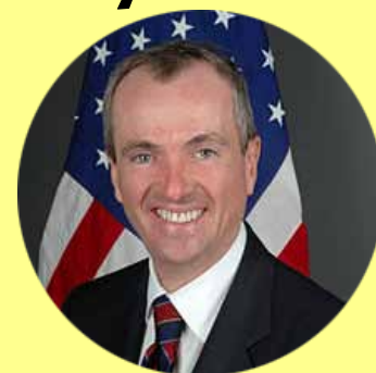
PHIL MURPHY DEMOCRAT FOR GOVERNOR